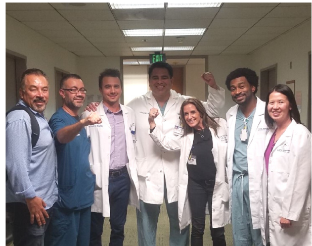
UCI Health PAs

With the passage of SB 697 this year, PAs no longer require chart co-signature and medical record review.